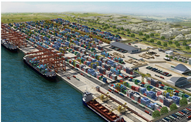
An artist's impression of the completed Nigeria's Lekki port project. Illustration courtesy of Lekki.