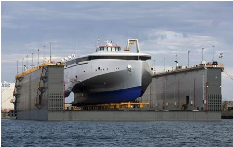
A floating dock at the Australian Marine Complex near Perth – it's the type acquired by NIMASA and that is rotting away in Lagos.